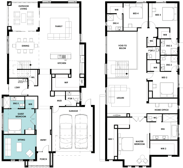
GUEST BEDROOM OPTION