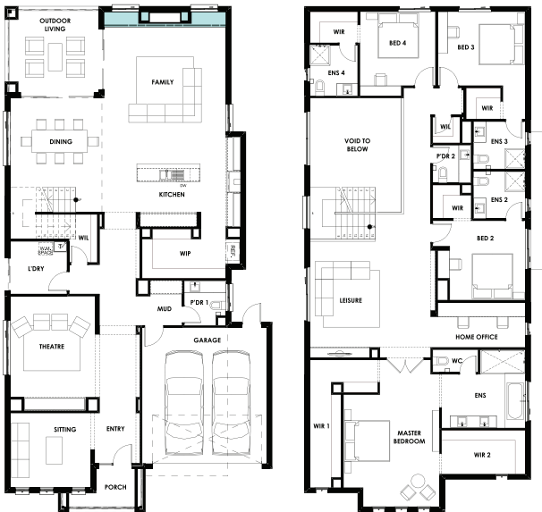
FIRE PLACE OPTION