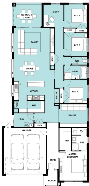
REAR FLIP OPTION