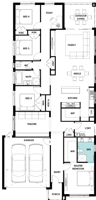
ALTERNATE ENSUITE OPTION