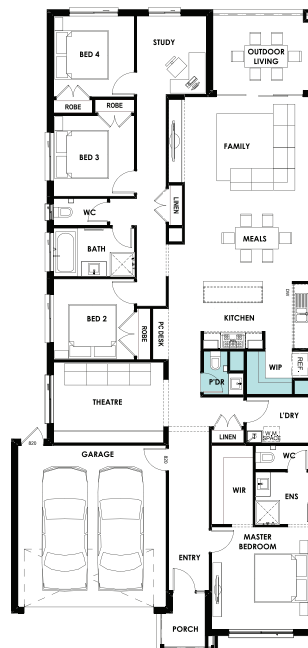
POWDER ROOM OPTION