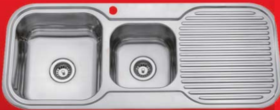
BASE MK3 STAINLESS STEEL BOWL SINK