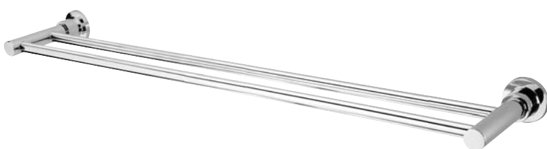
PHOENIX GEN X DOUBLE TOWEL RAIL