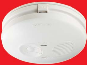
PHOTOELECTRIC SMOKE ALARMS WITH BATTERY BACK-UP