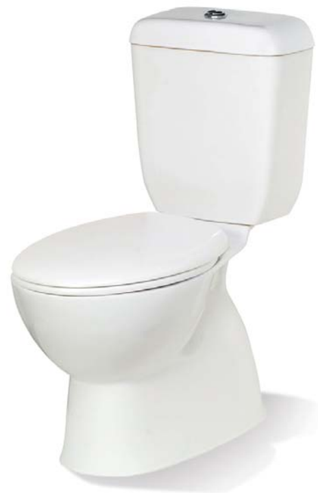
POSH DOMINIQUE DUAL FLUSH TOILET