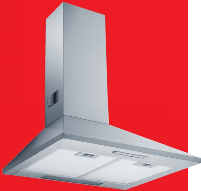
CHEF STAINLESS STEEL CANOPY RANGEHOOD