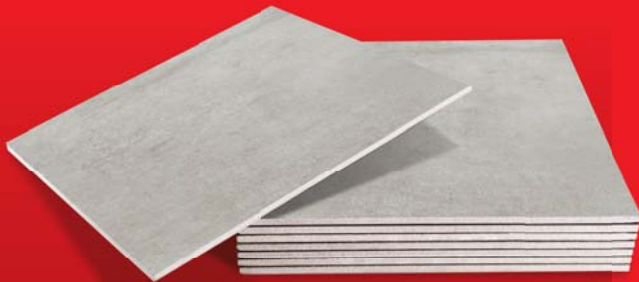
CERAMIC TILED SPLASHBACK