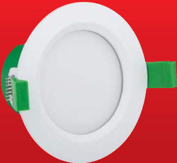
LED DOWN LIGHT FITTINGS THROUGHOUT HOME