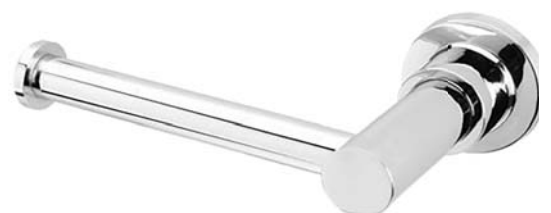
PHOENIX GEN X TOILET ROLL HOLDER