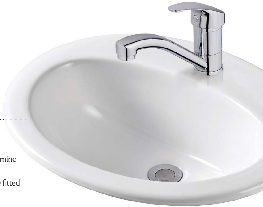
BASE CERAMIC WHITE BASIN