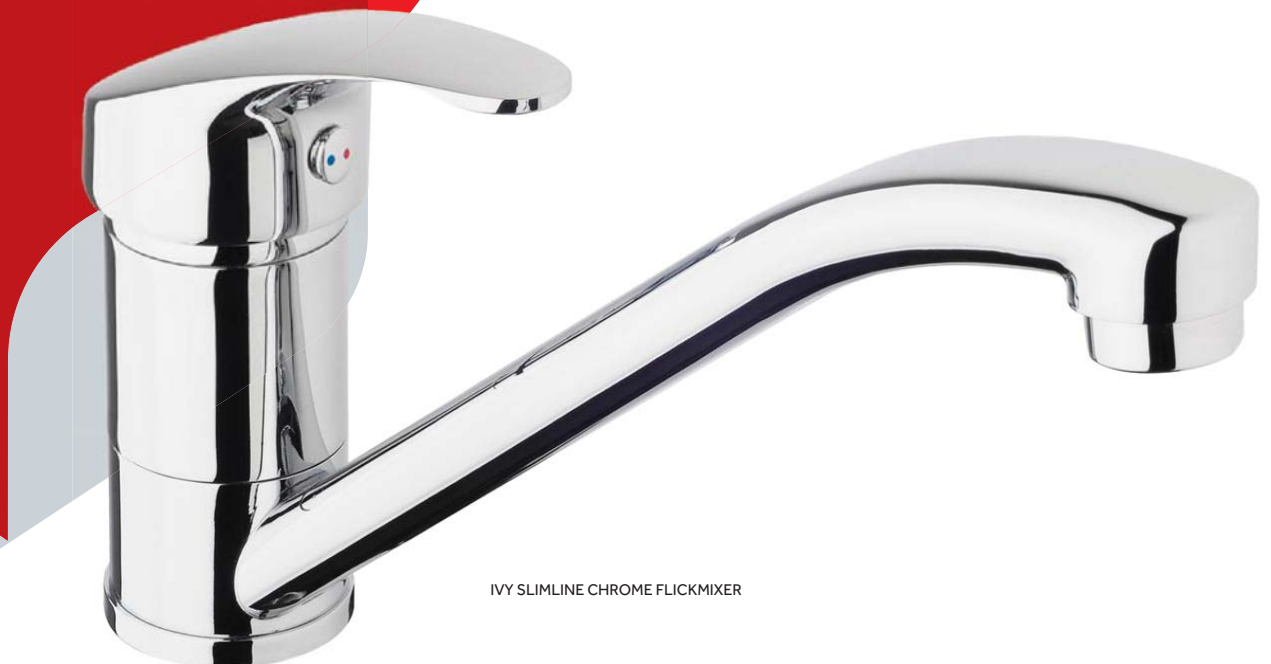
IVY SLIMLINE CHROME FLICKMIXER