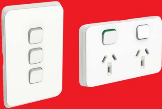
AMPLE POWER POINTS AND LIGHT POINTS