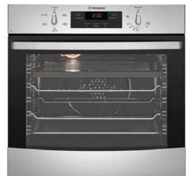
WESTINGHOUSE MULTIFUNCTION ELECTRIC OVEN