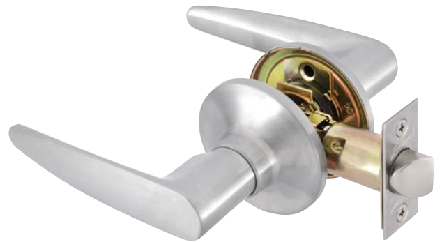
GAINSBOROUGH LEVER DOOR HANDLES