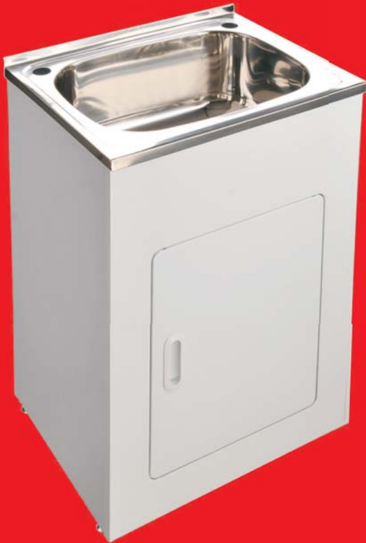
BASE STAINLESS STEEL TUB AND CABINET