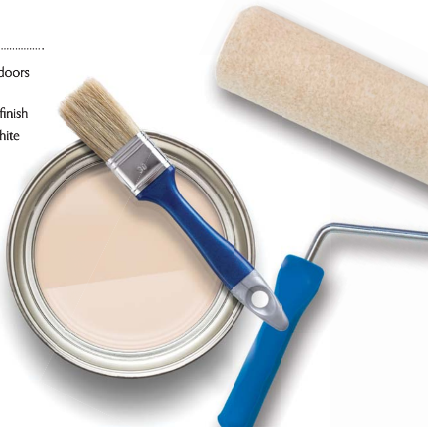
3 COAT LIGHT BASE SYSTEM