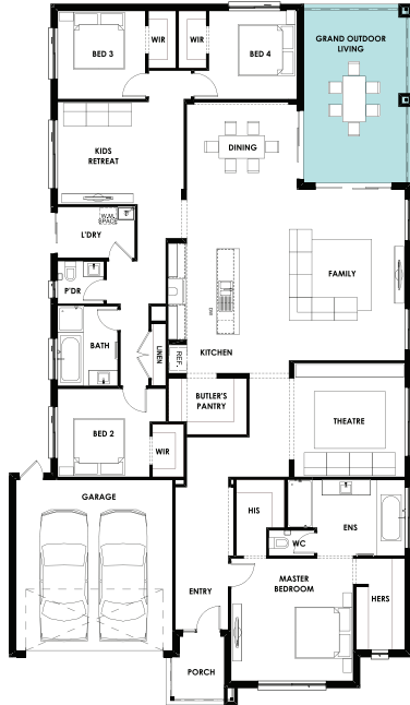
GRAND OUTDOOR LIVING