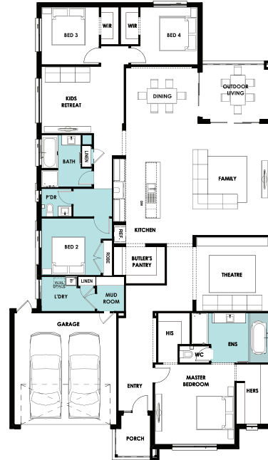
FREE STANDING BATH TO ENSUITE