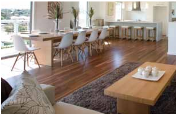
MCCUBBIN 2 STOREY FRONT CARPORT 3 BED