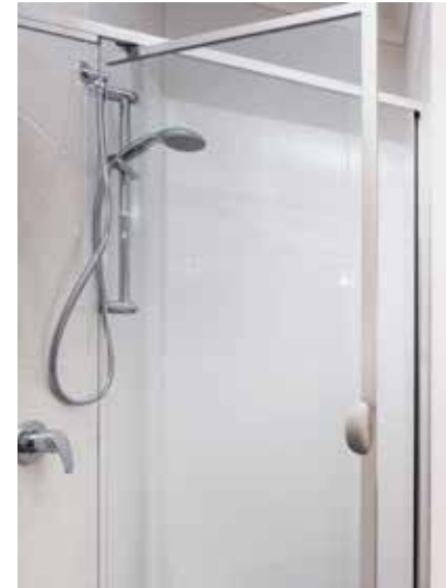
Pivot 2000 shower screen