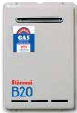
Rinnai Instantaneous hot water system