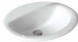
Seima Chios Classic Inset vanity basin