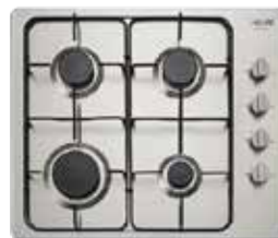
Euro 600mm gas cooktop