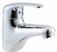
Siema Solid basin mixer