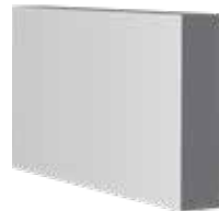
67 x 18mm Square Dressed skirting