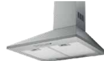
Chef 600mm canopy rangehood