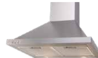
Euro 600mm canopy rangehood