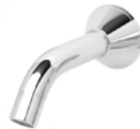
Phoenix Ivy bath spout