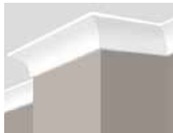
55mm Cove cornice