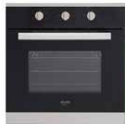
Euro 600mm underbench electric oven