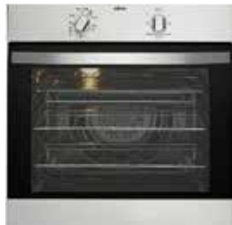
Chef 600mm underbench electric oven