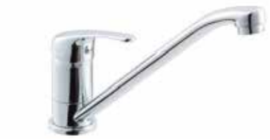
Seima Solid Select chrome sink mixer