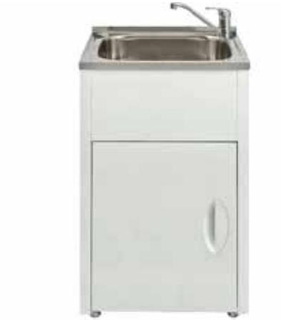
Seima Tilos metal laundry tub and cabinet