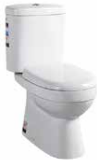
Argent Pace toilet suite