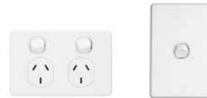
C2000 cover plates and switch plates