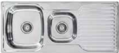
Seima Acero 1 ¾ bowl stainless steel sink