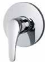
Siema Solid flickmixer