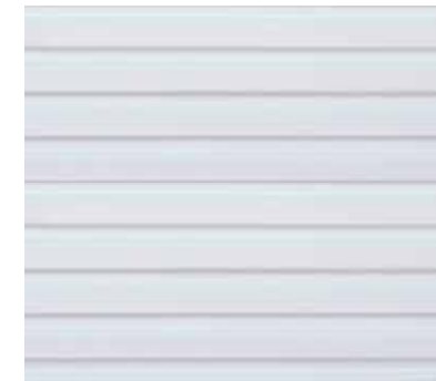
Squareline Deluxe roller door profile